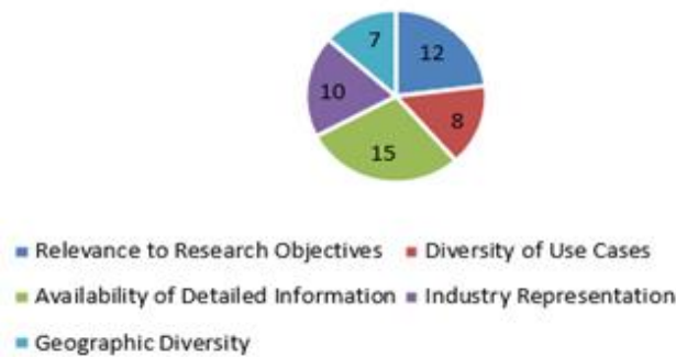
Number of Case Studies

Through the analysis of real-world case studies, we aim to provide concrete examples and practical insights into the ways in which organizations leverage AWS APIs to enhance database scalability, flexibility, and performance.