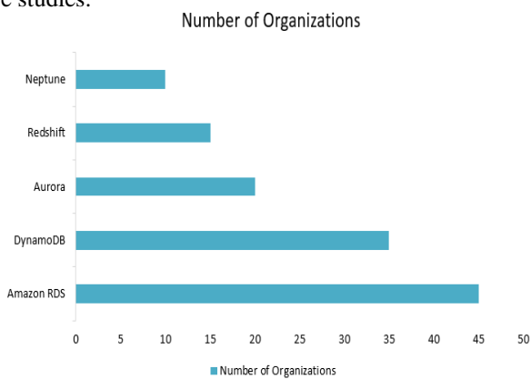
Fig. 1: The graph of the Distribution of AWS Database Services Usage

The methodology adopted for this research is designed to provide a comprehensive and systematic approach to investigate the utilization of AWS APIs for enhancing database scalability and flexibility. It encompasses several key components, including a thorough review of AWS’s architectural principles and database services, an extensive analysis of existing literature, and an in-depth examination of real-world case studies.