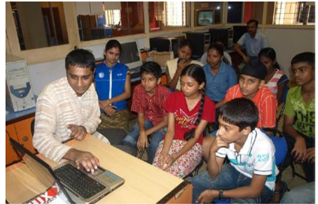
Fig.2: A virtual assistant built on generative AI can assist a teacher in planning unique and engaging classroom activities.

Recognizing the importance of developing AI skills for children, CBSE has introduced AI as a skill module in classes 6–8 and as a skill subject in classes 9–12. Additionally, there are several organizations that are creating virtual assistants for students, teachers, and parents to enable them to learn and teach better. Many such initiatives are now being seen across a diverse set of use cases.