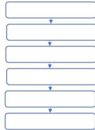
Figure 3. 1 Research Flowchart