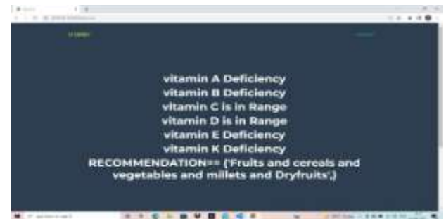
Fig 6: Final output where according to Deficiency, Food is recommended.