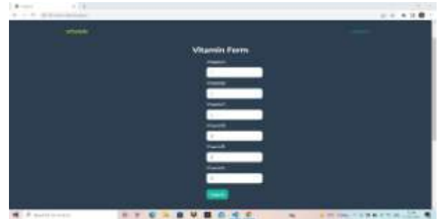
Fig 5: Form where vitamin values are to be entered.