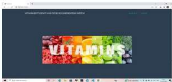
Fig 2: Dashboard of Vitamin Deficiency and Food Recommendation.