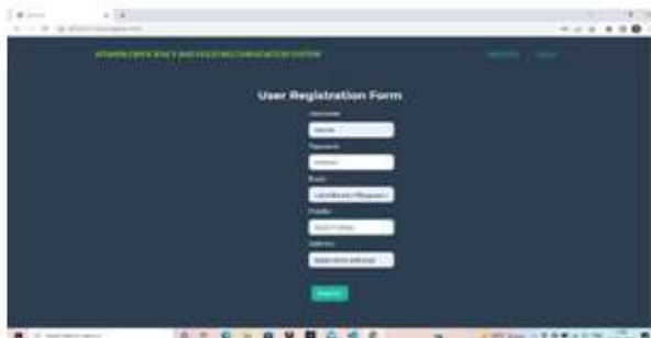
Fig 3: Registration of Vitamin Deficiency and Food Recommendation.