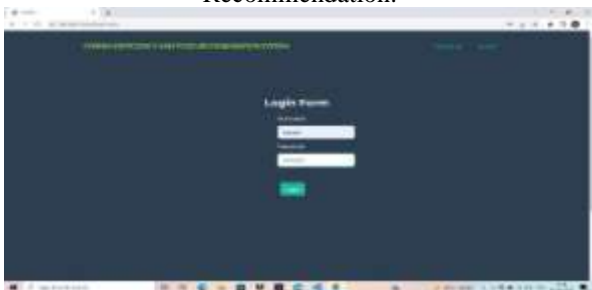
Fig 4: Login of Vitamin Deficiency and Food Recommendation