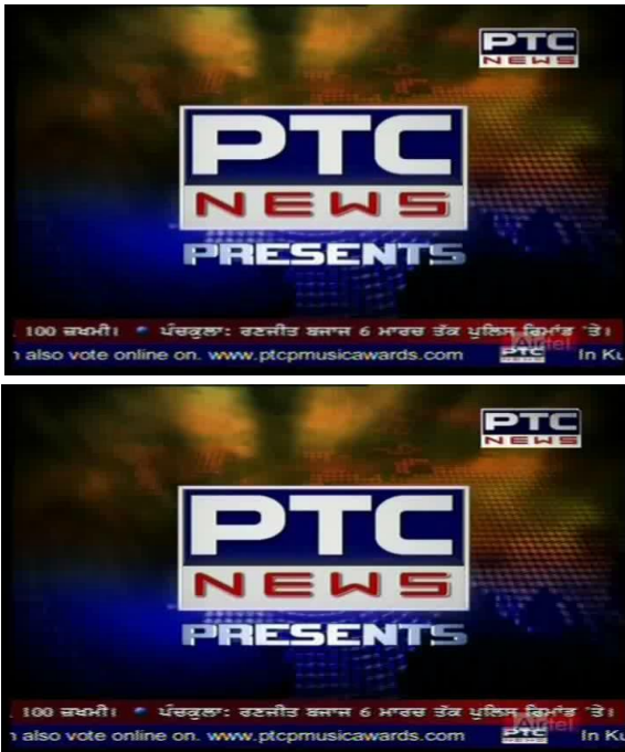
Fig. 2. Successive two Frames extracted from videos

These frames are then Parallely processed through two different algorithms viz. LoG and Otsu. The following figure (Figure 3) is showing the outcome of these algorithms respectively of the first two frames consecutively.