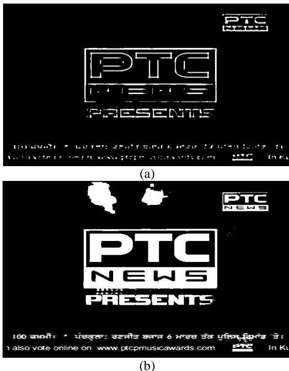
Fig. 3. (a) LoG Image, (b) Otsu Image

These frames are then Parallely processed through two different algorithms viz. LoG and Otsu. The following figure (Figure 3) is showing the outcome of these algorithms respectively of the first two frames consecutively.