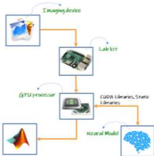
Fig. 2. Structural outline of image acquisition model

Coming to the second part of this model since it's a image-based system authentication we have use the neural network to recognize the image whether it the quality of image is fine for further processing and it also add a layer of security by checking if someone is try to fool the system with different means like by showing the image from phone or something like that. And to achieve this in MATLAB we have used the RESNET-50 model.