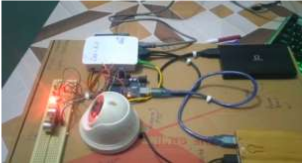
Fig. 3. Working model of the system

We have built a complete working prototype of the system which is been shown in figure 3.