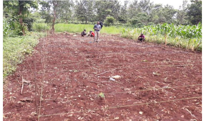
Fig. 1c. A view of experimental plots layout in PCEA Nkio secondary school farm-chuka

Garlic cloves were planted with the base of the clove down and the tip in upright position and covered with soil. The recommended spacing adopted was 30 cm by 15 cm and a planting depth of 5 cm. Hence, each experimental plot was having a total of 107 plants which translated to 222,453 garlic plants ha -1 . Once established, all other necessary maintenance practices were carried out appropriately. Weeding was done through uprooting as weeds emerged. Pests were controlled through regular application of Duduthrin® at the rate of 15 ml 20 litres -1 from the second week after garlic emergence at an interval of 14 days and stopped at 86 days after emergence. Diseases were controlled through regular application of Ridomil® fungicide at the rate of 40 gm 20 litres -1 from the second week after garlic emergence at an interval of 21 days and stopped at 86 days after emergence. Sprinkler irrigation was done from morning to mid- afternoon after planting and this was done twice per week during growth of garlic crop. Two weeks to harvesting, irrigation was stopped.