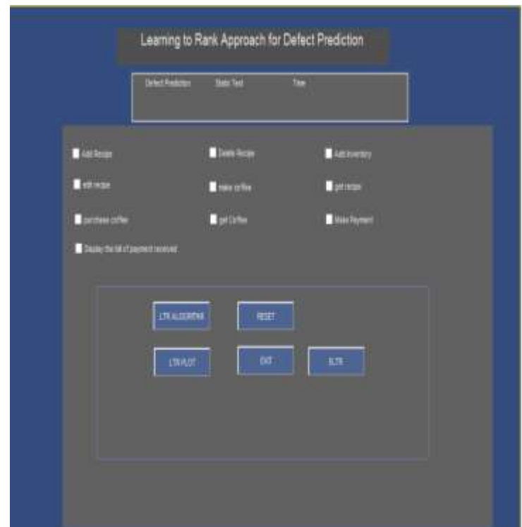
Fig 1: Interface is designed for implementation

The Rank-to-rank and improved Rank-to-learn algorithms are implemented in MATLAB. The