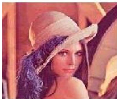
Fig. 10 Output Image