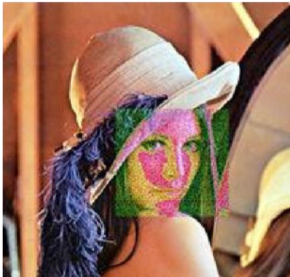
Fig. 12 Output Image