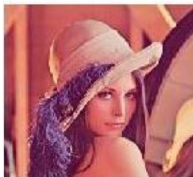
Fig. 9 Original Image