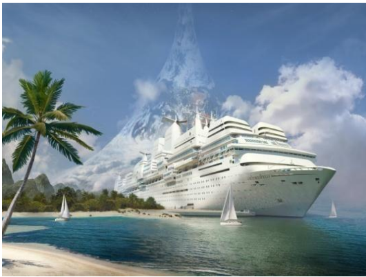
Figure 3: Original Image