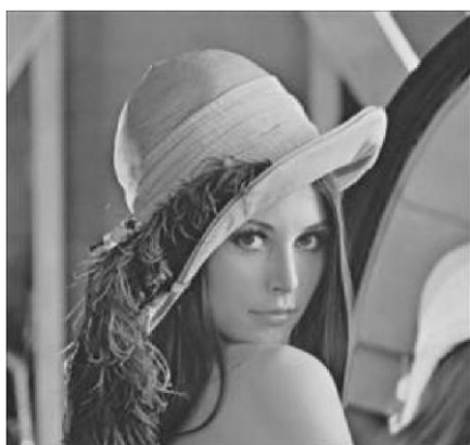
Fig. 6 Stegano Image