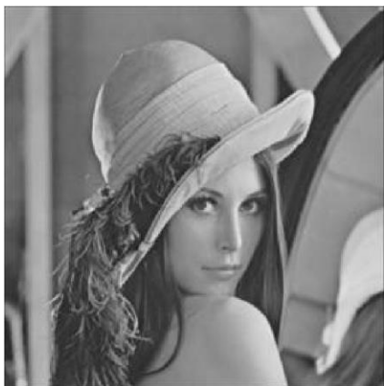
Fig. 5 Original Image