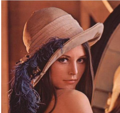
Fig. 11 Original Image