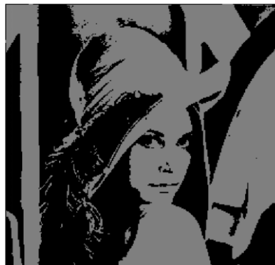
Fig. 8 Stegano Image