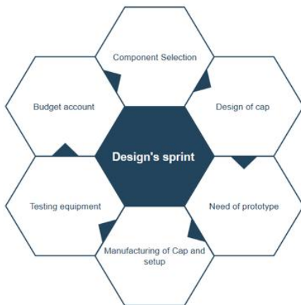
Fig 1. Parameters accounted in the Designs ‘Sprint

The process of prototype development initiated under the concept of “Designs” Sprint.” during which all the governing parameters to construct a model were listed down and solution categorisation.