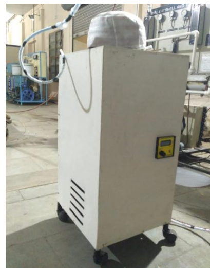
Fig 7: The refrigeration setup with the cap

The testing of the manufactured setup was carried out for a duration of 75 minutes on subjects to witness the effects of the system.