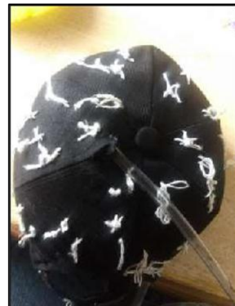
Fig 3: Top view of cap performed under iteration 2

Prototype Iteration 2: A fabric cap was covered with water level tubes wound inside the cap in spiral form and hand stitched to the fabric.