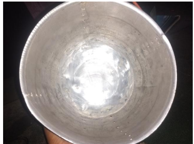
Fig 6: The inner surface of the cap