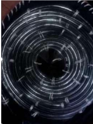
Fig 4: Inside of cap under iteration 2

Refrigeration Setup: The system circulating the cooled liquid through the pipes of the cap works on the concept of vapour compression cycle. The components of the system are - evaporator, compressor of 0.5 TR, air cooled condenser, thermostatic expansion valve. The connection lines are insulated with polystyrene. The system consists of a submersible pump which is accommodated in the evaporator which circulates the coolant which in this case; is water.