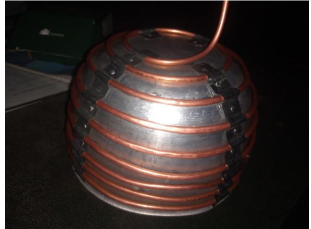
Fig 5: Copper tube winding on the outer surface of the cap

Refrigeration Setup: The thermocouples are placed at 1 at evaporator inlet and outlet each, 1 at condenser inlet and outlet each, 1 inserted in the water consisting of evaporator coil and 1 on cap. A digital temperature indicator with a least count of +0.1^{\circ}\text{C} showed the temperature readings. A submersible pump of 2.8 m pressure head was taken to circulate the coolant (water) around the cap, the flow rate was 0.361 litres per minute.