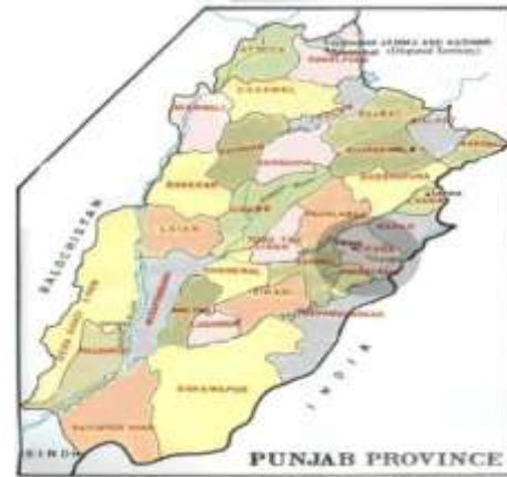
Fig 3.1: Location of study area

a population of 191,313. It also contained the administrative headquarters of the tehsil. The Sutlej River flows about 30 km to the north-west while the river Ravi meanders about 40 km south-east of the city. The Lower Sutlej canal is the main source of irrigation water, which meets the requirements of 80% of cultivated land. The district on the whole is flat alluvial plains formed by Sutlej. The land close to the river is relatively lower than that away from the river towards the west. The general elevation of the land is about 150 m above the sea level. Average altitude the area above mean sea level is about 214 m.