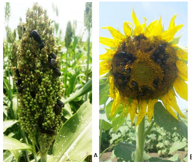
Figure 2: Adult of Pachnoda interrupta feeding on sorghum head (A) and sunflower disc (B)

The results showed that the adult beetle is the damaging stage it was found feeding on the flowers and suck out all the contents of sorghum (Figure 2A). Further, the beetle feed on the soft peduncle of sorghum in late sown sorghum fields. They are observed to aggregate on sorghum heads sucking out all the contents of the grain at the early milk stage. On the other hand, the beetle feeding behavior of Pachnoda interrupta on sunflower started on the periphery of the disc toward the center (Figure 2B).