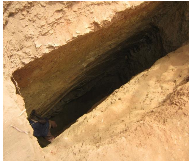
Plate 6: Heavy Earth Removal by Miner

Effects on Biological Environment: The result also shows that artisanal miners create lots of noise in the process of mining particularly in the process of drilling of minerals under the rocks. The vibration nature in the process of mining affect the settlement around the areas where mining takes place for example in Bida area most settlement around the mining site tends to relocate to other areas. Also included on the effects are those created to the fauna. The noise and vibration created affect the animals to be forced out of their natural habitat to other location and the vegetation cover are been cleared for mining activities.