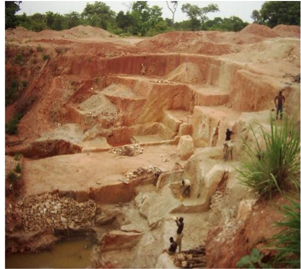
Plate 2: Artisanal Mining Iron Ore in Bida

The miners after digging and extraction of minerals leave the area unreclaimed their by causing serious erosion (Plates 3 and 4).