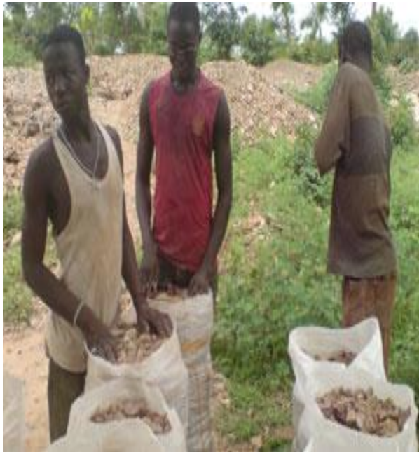
Plate 4: Artisanal Mining Iron Ore in Kontagora

The result shows that artisanal mining involves the miners create harmful effects as a result of digging the minerals come in contact with water bodies thereby releasing heavy and poisonous metals contain in the rocks as gangus are deposited (Plates 5 and 6). This might result in polluting the water bodies and the underground water.