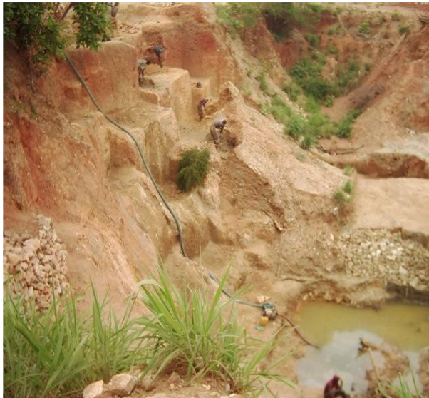
Plate 1: Artisanal Mining Iron Ore in Kontagora

The activities of these artisanal miners as alter the physical nature of the environment. This can be seen in most of the Plates 1 and 2 where the top and nutritious part of the soil are been altered where the nutrient are been carried away as a result of digging of pits and tunnels (lotos), dumping of debris heaps and quarrying.