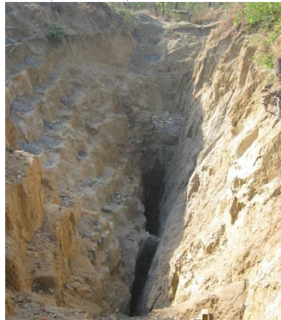
Plate 3: Artisanal Mining Iron Ore in Kontagora

The miners after digging and extraction of minerals leave the area unreclaimed their by causing serious erosion (Plates 3 and 4).