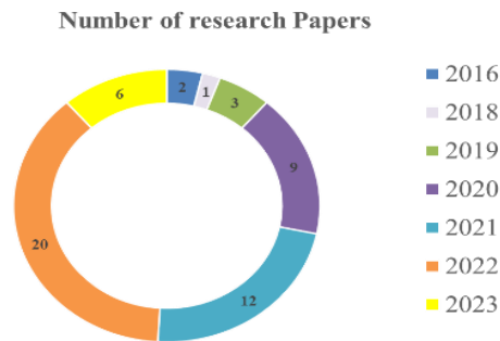
Figure 2: Year wise published paper

Emerging trends in vulnerability discovery and cybersecurity countermeasures drawn from the Perish tool's references is as described in section below.