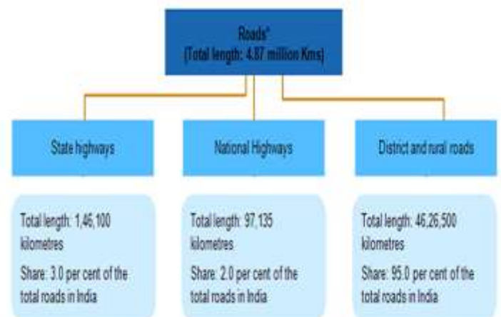
Fig.2: Road and Highway Project Planning

Roads infrastructure in India may be studied under three headings: State Highways, National Highways and district and rural roads. Following are the details about the networks.