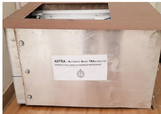
Fig. 2. Prototype of System

microwave generating parts get energized. Using that energy it get turned on. During that time the system gets off after the pre-set delay for the disinfection and it get on whenever a signal is getting from the sensor connected to it. When the bin gets full it can be collected the deposited waste from the separately fitted door in side of it.