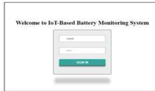
Fig.05: User interface for the proposed battery monitoring system