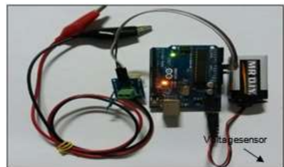
Fig.2: Battery voltage measurement using voltage sensor circuit.

The correctness of the GPS coordinate was ascertained in this subsection by verifying the SIM808 GSM/GPRS/GPS module's characteristics. Additionally, this experiment will ascertain the module's usefulness. The module's experimental configuration is depicted in Figure 3. Five (5) distinct target sites were used for the trials, and each location's GPS coordinates were gathered. The coordinates obtained from the Google Maps website were then contrasted with these GPS coordinates.