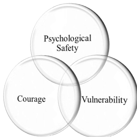
Figure 3 : Interconnectedness of Psychological Safety, Courage and Vulnerability.

The presence of these concepts can assist in the development of an individual and to upgrade their skills and abilities. In context of a group, it could help in knowledge sharing and achieving bigger accomplishments together when the people open up with their share of weaknesses and collaborate to overcome those weaknesses. The organization as a whole can benefit from the understanding of these concepts as the employees will then want to stay in the organization and it would reduce the attrition rate and result in the growth of the organization and can also enhance the organization citizenship behaviour.