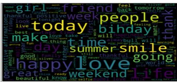
Fig 4.2.4 words in non racist/sexist tweets

As we can clearly see, most of the words have negative connotations. So, it seems we have a pretty good text data to work on. Next we will the hashtags/trends in our twitter data.