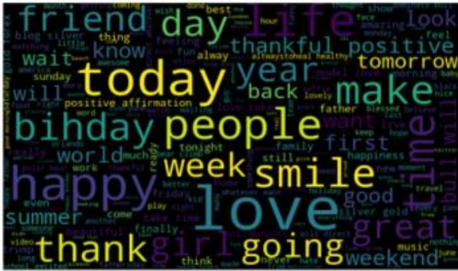
Fig. Understanding the common words used in the tweets

We can see most of the words are positive or neutral. With happy and love being the most frequent ones. It doesn't give us any idea about the words associated with the racist/sexist tweets. Hence, we will plot separate wordclouds for both the classes (racist/sexist or not) in our train data.