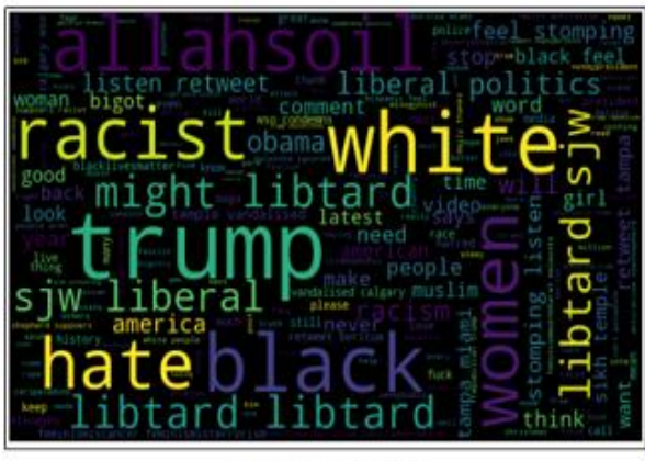
Fig 4.2.5 racist/sexist tweets

We can see most of the words are positive or neutral. With happy, smile, and love being the most frequent ones. Hence, most of the frequent words are compatible with the sentiment which is non racist/sexists tweets. Similarly, we will plot the word cloud for the other sentiment. Expect to see negative, racist, and sexist terms.