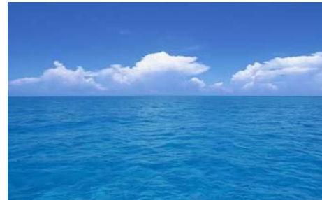
Figure 18: Sea

Of perilous seas, in faery lands forlorn. (66-70)