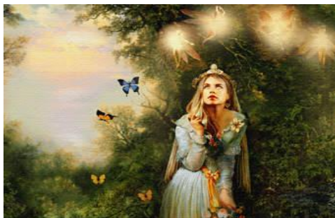
Figure 19: Fairy land

The poet believes that the nightingale is an immortal bird. Her song has been heard since time immemorial. It is the bird that gave joy to Ruth, who was a widow and whenever she wept in the memory of her husband, the sweet song of the bird consoled her. In the alien country, she became a gleaner in fields of