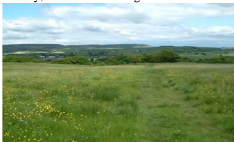
Figure 20: Meadow

The poet believes that the nightingale is an immortal bird. Her song has been heard since time immemorial. It is the bird that gave joy to Ruth, who was a widow and whenever she wept in the memory of her husband, the sweet song of the bird consoled her. In the alien country, she became a gleaner in fields of