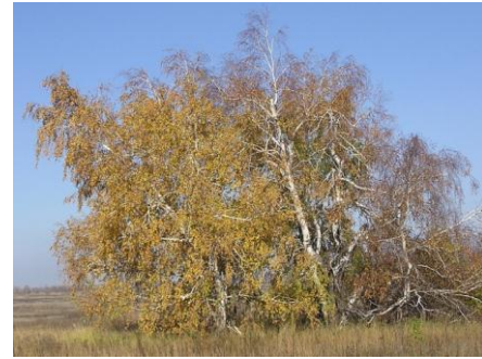
Figure 10: Thicket