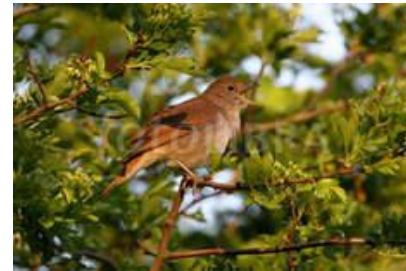
Figure 1: Nightingale

unchanged by man.” A nightingale is a major word in the ode. The nightingale is a small passerine bird best known for its powerful and beautiful song. Seeing a nightingale is always difficult, as it is famous for its ability to lurk in thick cover where it is difficult to mark.