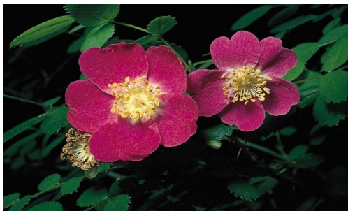
Figure 13: Eglantine