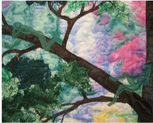
Figure 2: Dryads

He takes the nightingale as a light-winged Dryad of the trees. Dryad is a wood nymph, also called hamadryad, in Greek mythology, a nymph or nature spirit who lives in trees and takes the form of a beautiful young woman. Dryads were originally the spirits of oak trees ( drys : "oak"), but the name was later applied to all tree nymphs. It is believed that they live only as long as the trees live in. For him, the song of the bird is a source of pleasure. The place of solitude is presumed as a place of pleasure and peace. Dryads are represented as peace loving beings.