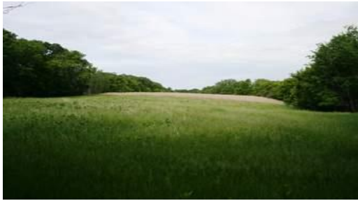
Figure 22: Valley-glades