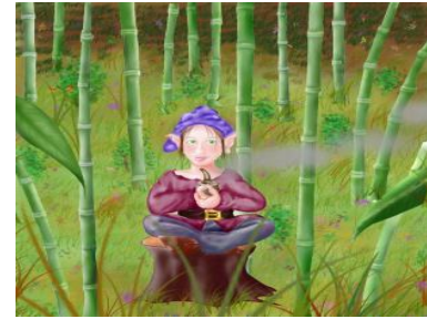
Figure 23: Elf

The poet realizes that imagination and an elf (an imaginary small being with magic power) cannot cheat him for a long time. The song which was regarded as joyous seems to be melancholic. The song of the nightingale starts subsiding and fading away gradually from the meadow, the stream, hill-side and valley-glades. The illusion which his imagination had created now vanishes. The song of the bird also becomes fainter and fainter, and the poet is left in doubt whether he was dreaming all this time or his experience was real. The nature, especially the song of the bird had mesmerizing effect on the poet.