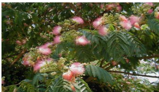
Figure 8: Flowering thick forest

Wherewith the seasonable month endows (41-44)