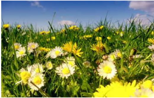
Figure 9: Grass flowers