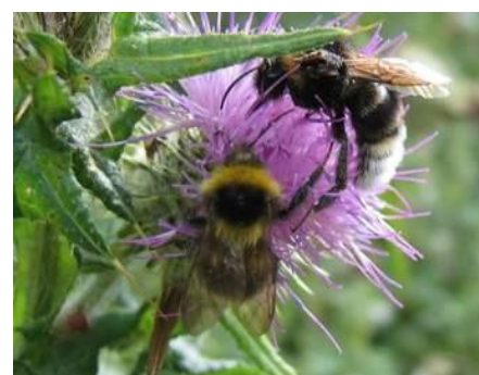
Figure 16: Flies (Bees)

Although the poet cannot see the flowers due to the thickness of the garden, he recognizes them through their fragrance. He comes to identify that the grass, the thicket, and the