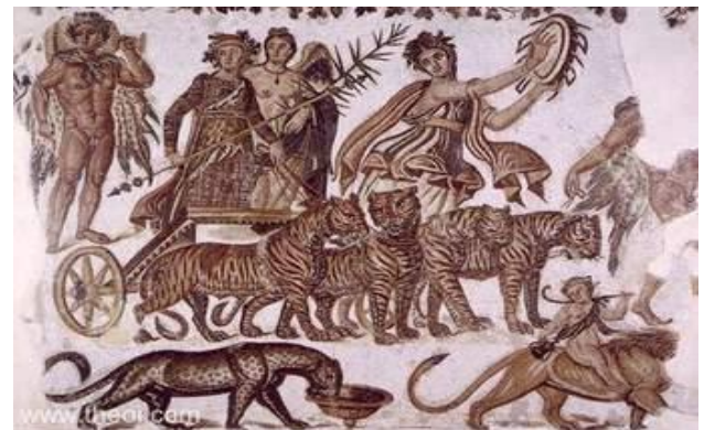
Figure 5: Bacchus, a Roman god of wine

Away! away! for I will fly to thee, Not charioted by Bacchus and his pards, But on the viewless wings of Poesy, (31-33)