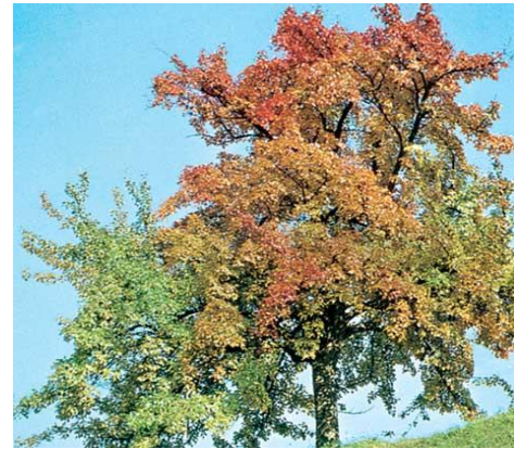
Figure 3: Beech

The poet thinks that he has drunk the water of Hippocrene. Hippocrene is a spring on Mt. Helicon. It is sacred to the Muses and it was formed by the hooves of Pegasus. Its name literally translates as "Horse's Fountain" and the water is supposed to bring forth poetic inspiration when it is drunk. Pegasus is a mythical winged divine stallion who is one of the most recognized creatures in Greek mythology. He desires to disappear into the dark forest as an indispensable component of nature.