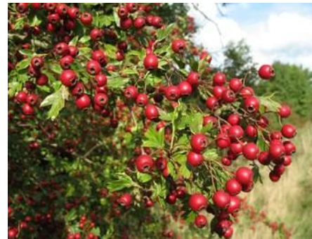
Figure 12: Hawthorn