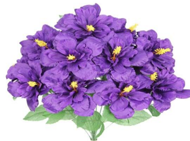
Figure 14: Violet