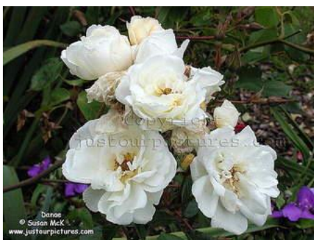
Figure 25: Musk-rose