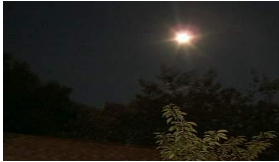
Figure 6: The moon

Cluster'd around by all her starry Fays;