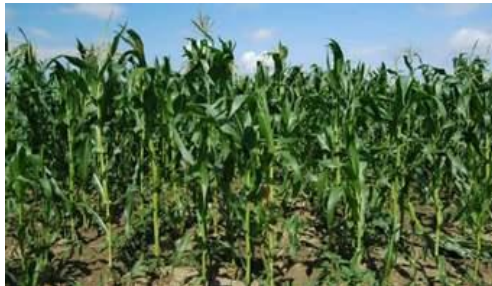
Figure 17: Corn field