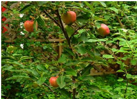
Figure 11: Fruit tree