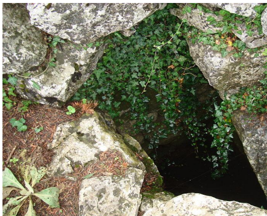
Figure 4: Hippocrene source on Mt. Helicon

Full of the true, the blushful Hippocrene, With beaded bubbles winking at the brim, And purple-stained mouth; That I might drink, and leave the world unseen, And with thee fade away into the forest dim. (16-20)