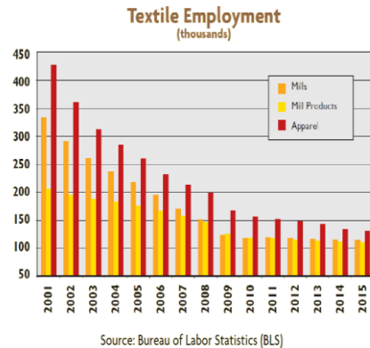
Fig. 5. Textile Employment in US