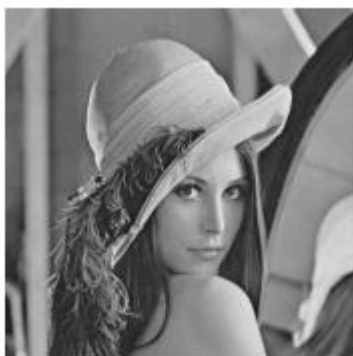
Fig.2 Test image

In this section, we experimentally evaluate the embedding performance of our proposed encrypted-domain. The test set is composed of 100 images of size 512 \times 512 with various characteristics, including natural images, synthetic images, and highly textured images.