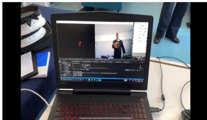
Fig. 5. Object Tracking Procedure

As mentioned above, we used an open source code as the flight algorithm (MultiWii v2.4) and we made the necessary modifications. The object tracking is mainly achieved through the client-computer and the use of the open source libraries from the Open Computer Vision project (Open CV2). Therefore, we developed an algorithm using Python (Avouris, 2019; Chollet et al., 2018) which connects to the ESP-32 and at the same time streams the video feed from the ESP-EYE. The user has the total control of the camera in the beginning through the A, S, D, W and 'space' keys and as soon as he selects a target by using the trackbars and locking onto the desired color, by pressing 'ESC' the system will automatically track the object. More specifically, the algorithm converts the incoming frames from RGB to HSV color space, so that the user can easily choose the desired color and then it creates the contours corresponding to the user's choice. Afterwards in the tracking section, we set two centers, the first one is the center of the targeted object and the second is the center of the incoming image and the algorithm via the correlation of the two centers, sends the corresponding commands to the ESP-32 so that the two centers can meet (Rojas et al., 2017; (Hernandez-Martinez et al., 2015).