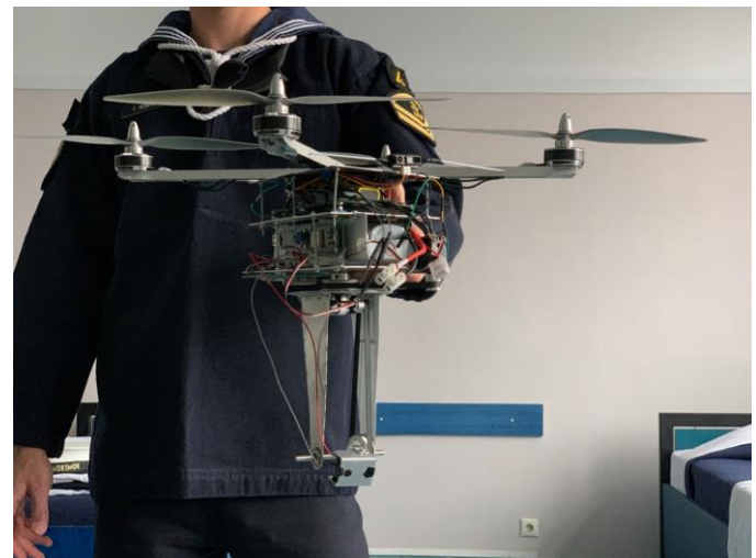
Fig. 7. The drone in its final form