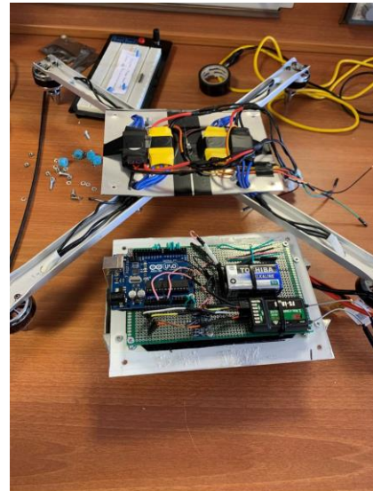
Fig. 3. Drone's electronic Circuit