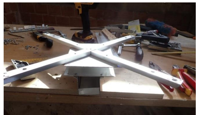
Fig. 1. Drone's Frame

For the construction of the frame we used aluminium as the main material in order to achieve the desired durability and strength. The two axes where the motors are mounted (50cm long each), are made from aluminium channel section and they are pacted in an aluminium sheet (200x140x1.5mm). The electronic parts are placed on an aluminium sheet (200x140x3mm) and the battery is situated in an aluminium made box underneath the whole construction. All the pieces are connected with screws so they can be easily dismantled.