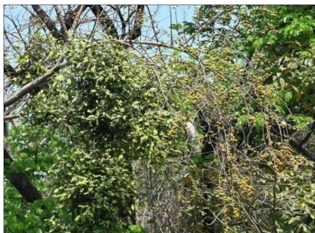
Fig. 3. Mistletoe on Ficus exasperata tree near the main gate of WIP campus.