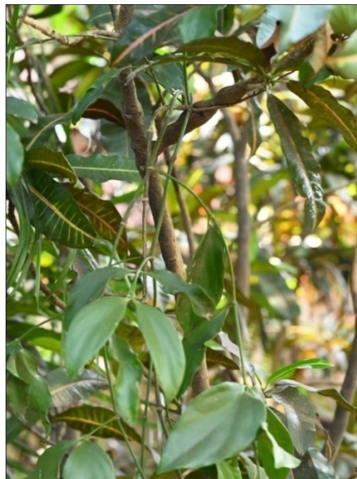
Fig.1. Parasitic growth of Loranthus spp. on garden croton ( Codiaeum variegatum ). Note the swelling on the branch at the point of infection by mistletoe.

Host-parasite associations are dynamic and new host combinations with known host species are continuing to be documented. The reasons for the dynamic nature of host-mistletoe combinations include the presence of 'novel' (i.e. exotic or 'non'-indigenous) host species [6]. During the present work, Loranthus sp. infestation on a new host shrub species, garden croton ( Codiaeum variegatum ) of the family Euphorbiaceae , was recorded by the author for the first time, and observed the development of hypertrophy of the host branch at the point of infection (Fig.1). Some of the major observations on the distribution of the parasite on other host trees, in and around the campus of a large wood-based industrial complex in Valapattanam during January-February, 2020 are also presented here (Table.1).