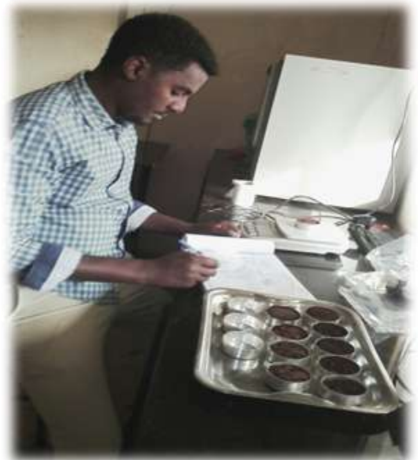
Figure2.2: soil moisture measurements after and before oven dry

In this study both secondary and primary sources was used. Soil samples using auger at 30 cm depth intervals from the surface up to maximum rooting depth of the crop (0-30, 30-60, 60-90 & 90-120cm) for the determination of BD, texture, FC, PWP, and soil moisture content, organic matter content, soil pH, total nitrogen and available phosphorus. Soil moisture before and after irrigation was determined by gravimetric estimation/oven dry method.