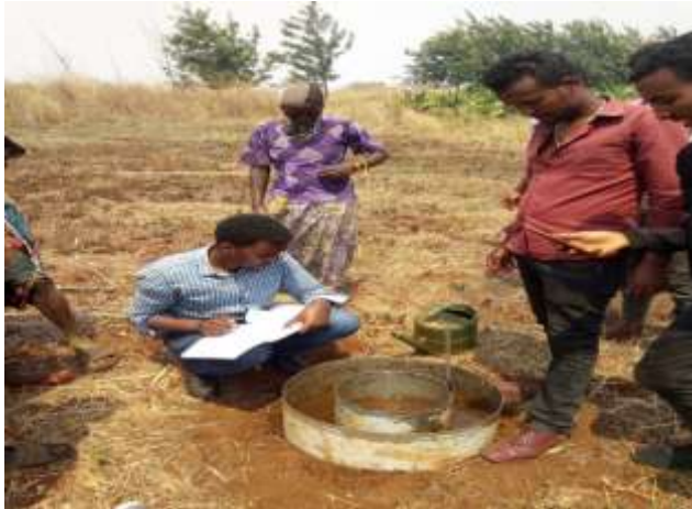
Figure 2.3: Infiltration rate determination Golda small scale irrigation scheme