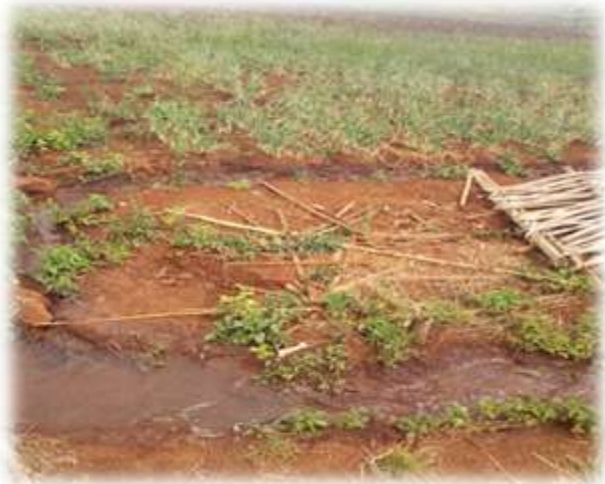
Figure 3.2: water stressed and poor on field water management at onion irrigation field