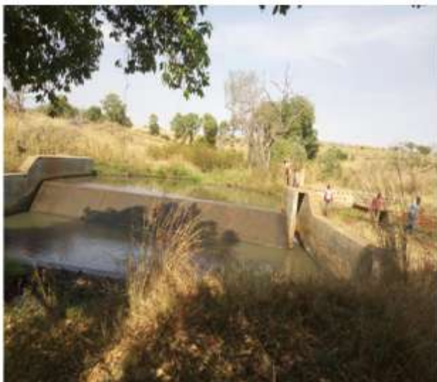
Figure 2.1: Diversion weir of Golda small scale irrigation scheme

Golda small scale irrigation scheme is located at a distance of about 18km from Assosa to the west direction, the capital city of the region. Golda catchment lies between Latitude 9^{\circ}50'25.77'' and 9^{\circ}56'58.2'' N and Longitude 34^{\circ}33'4.7'' and 34^{\circ}38'35.5'' E. It has an area of about 53\text{km}^2 . It is characterized by mountainous land in its southern boundary and the rest of the area up to the point of the diversion is flat land with smaller areas bordering the river having moderate to steep slopes. The Golda River descends to 160m in 10 kilometers with an average slope of 0.016m/m. Cultivation is limited to the areas adjacent to the river in Gambashire Kebele. Other areas between the foot of the mountains and the kebele are covered with grass and bamboo forests. The mountains are also covered with tree forests. No flow gauging station had been installed on the Golda river to-date to measure the flows.