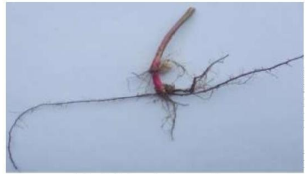
Fig 2: Morphology of root

A. nodiflora shows a long, central and dominant root from which lateral roots were grown (Fig 2). Typically a taproot is somewhat straight and very thick, is tapering in shape and grows directly downward which were helpful to absorb the water, nutrients and minerals from the soil and helps in anchoring of the plant. Roots are in light brown colour.