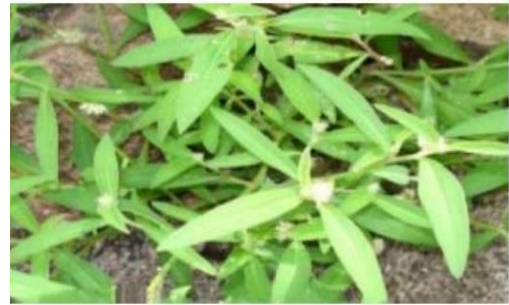
Fig 6: Morphology of leaf

Anatomy of stem: The stem anatomy of A. nodiflora (Fig 4) shows the epidermis, cortex, ground tissues and vasculature. Epidermis: It is a single layered. Outline is curved showing ridges and furrows. Some of the phloem tissue is present in the ridged portions. Cortex: It is 2-3 layered. Collenchyma tissue is present and is chlorenchymatous. Cortical cells may contain stored carbohydrates or others substances. Such as resins, latex, essential oils and tannins. Endodermis is present. It is one layered. Vascular tissues: 1-8 vascular bundles are seen. These Vascular bundles are conjoint, collateral, open and endarch. The arrangement of the vascular bundles is circular. The shape of the Vascular bundles is ovate. Xylem is present towards the center and phloem is present towards outside. Xylem and phloem are separated by cambium. Sclerenchyma caps the vascular bundles which provide support to the plant. Pith: At the centre of the stem parenchymatous pith region is present.