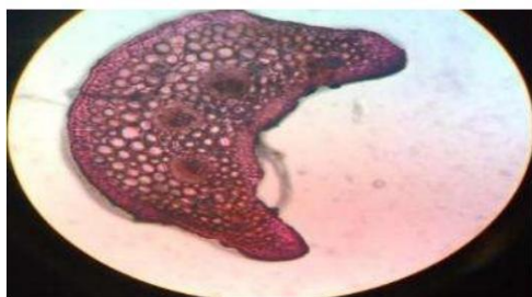
Fig8: T. S of petiole

The petiole anatomy of A. nodiflora (Fig 8) shows the epidermis, cortex and vasculature. Petiole shape in T. S is round. Epidermis: It is present and it is single layered and simple. Cortex: Epidermis is followed by cortex which is 2-3 layered which consists of collenchyma. Two protruberances are seen. These protruberances are seen at the two end sides of the petiole. Collenchyma and parenchyma tissues are seen in these protruberances. Vascular bundles: These are present in the cortex. 3-4 vascular bundles are present. These vascular bundles are ovate. Bundle sheath is also seen around each vascular bundle. Xylem and phloem is present. Xylem is present towards the center and phloem is present towards the outside.