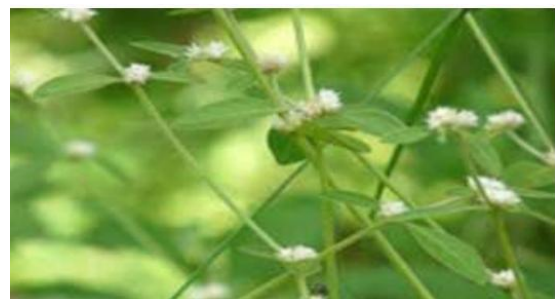
Fig1: Allmania nodiflora habit