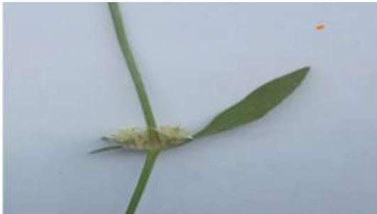
Fig 4: Morphology of stem

stem. Stem is cylindrical and partially weak. Stem is creeping and bend on the earth surface (Fig 4). 2.2