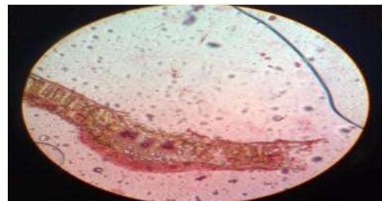
Fig 7: T. S of leaf

The leaf anatomy of A. nodiflora (Fig 7) shows the epidermis, mesophyll and vasculature. Leaf in T. S shows crescent shape. Epidermis: It is present and single layered with narrow tangential cells with thin walls and barrel shaped cells. Present on both the upper and lower sides of the leaf. Mesophyll tissue: There are two types of mesophyll tissues are present. These are palisade and spongy tissues. The palisade tissue is present towards the upper region and it is 2 layered. The spongy tissue is present towards the lower and it is 3 layered. Vascular bundles: They are arranged in mesophyll tissue. 3 vascular bundles are seen among the mesophyll tissue. These vascular bundles are oval in shape. Xylem is present towards the center and phloem is present towards the outside. Anomocytic stomata are seen.