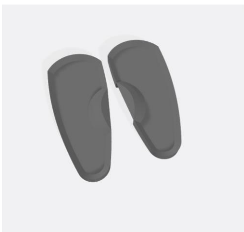
Fig. 1. Footprint Orthotics Diagram