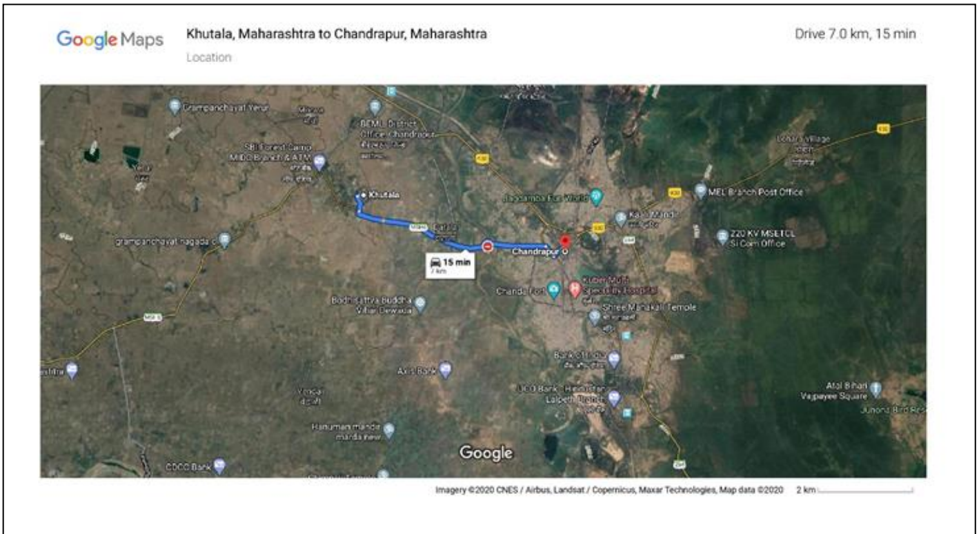
Fig. 1. Location and distance between two stations.

The opposite of CO, SO 2 in the city centre seems very