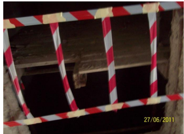
Fig 7 Warning Tape Showing there is an Open Hole