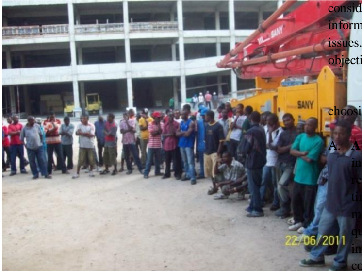
Fig 8. Site-operatives listening to at the Toolbox Meeting

appropriate for particular circumstances. It is important to first consider the objective of communication i.e. to persuade; inform; question or instruct the workers on health and safety issues. This will now be tailored to the strategy that suits the objective of the communication.