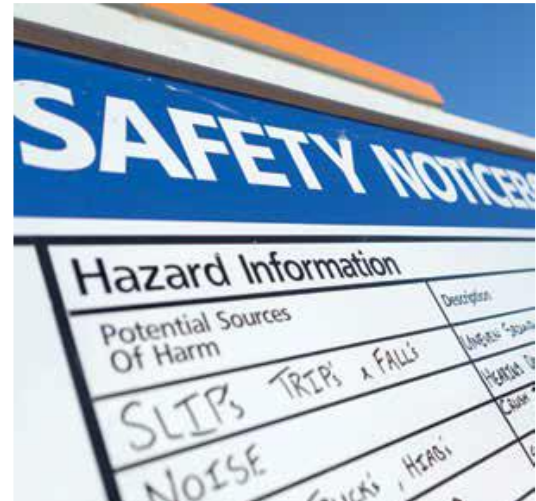
Fig 5. Safety Notice Board

refresher information, accident and incident report summaries, procedure updates, minutes of safety review meetings and safety inspection reports. Notice boards should not be used to display detailed procedures, as they will not be read. It is very important to update notice boards by removing obsolete materials.