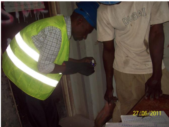
Fig. 3. Safety Officer Providing First-Aid to the Injured Workers