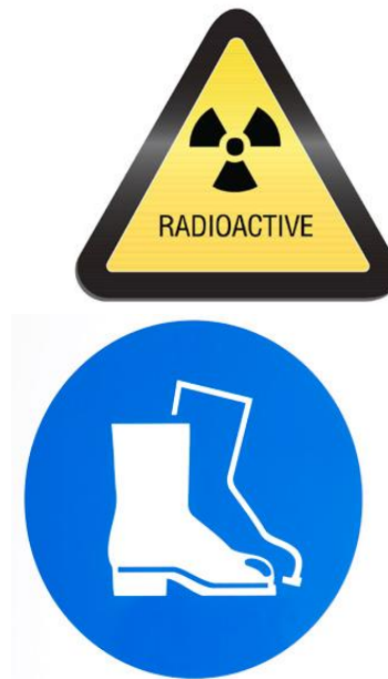
Fig. 6 Standard Health and Safety Signs on Construction Sites