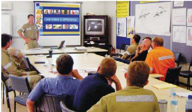
Fig 4. Site-operatives undergoing training on health and safety

preventive actions. Training also provide workers with ways to obtain added information about potential hazards and their control; they could gain skills to assume a more active role in implementing hazard control programs or to effect organizational changes that would enhance worksite protection. Training in safe work methods should involve raising employee's awareness of their true values towards health and safety, include being able to work without injury so they can continue to provide for their family.