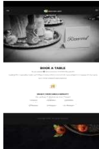
NO. OF PERSON SELECTION