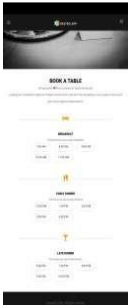
TABLE BOOKING PAGE