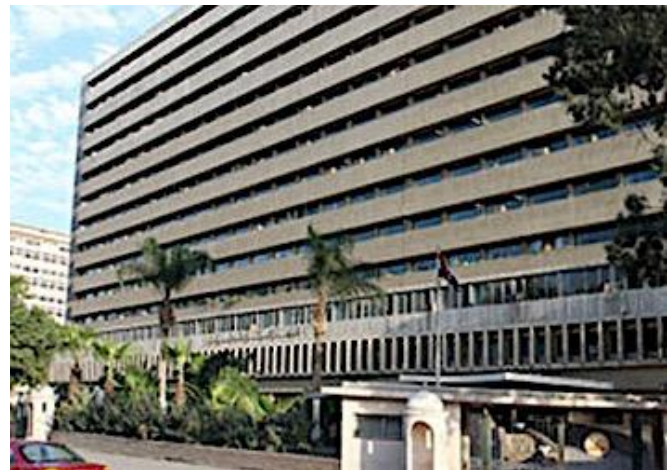
Fig. 7. The Accountability Central Authority building in Medinet Naser , the author

Nevertheless, Nasser's regime's fear of diminishing its political control over the labor force prevented satellite towns' implementation (Serageldin 1985, 123) and shifted to suburban development. Since the villa was the primary residential type in Medinet Nasr , a bright contrast was created. The contrast was achieved due to the authoritarian building's grandeur that stood for the state's power and modernity against the villa size (Figure 7).