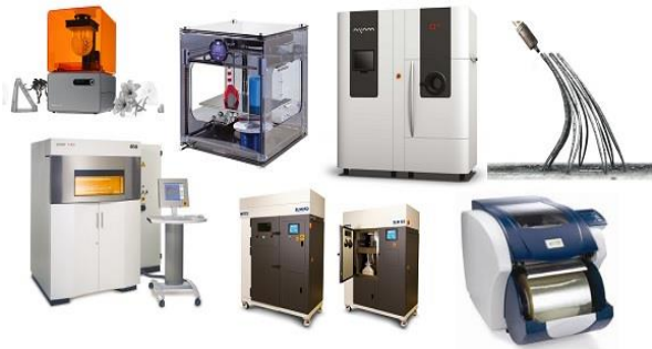
Figure 2: Different types of 3D Printers

Now here arise a question what materials do 3D printers use? 3D printers can use a wide range of materials like plastic, resins, ceramics, titanium, bronze, stainless silver, gold, etc. The most popular material used is plastic.