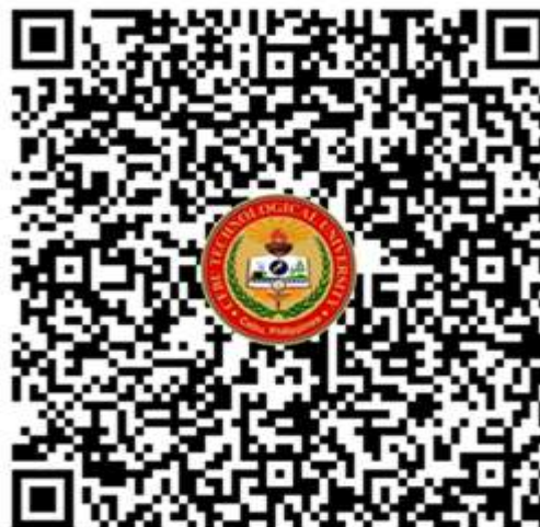
Fig. 5. Quick Response Code