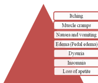
Figure 1: Symptoms of Chronic Kidney Disease

When kidneys are working well, they remove creatinine from the blood. As kidney function slows, blood levels of creatinine rise. The disease usually get worse slowly, and the patient is asymptomatic until kidneys are badly damaged. In the subsequent stages of CKD the patient also may notice symptoms that are caused by waste and extra fluid building up in the body. The usual symptoms developed may be depicted as follows: