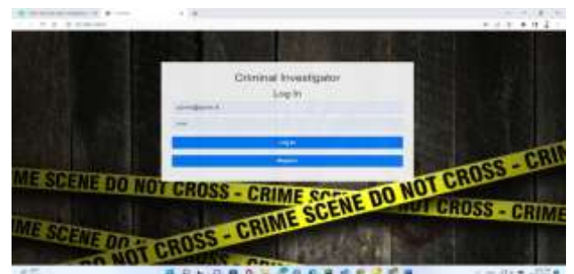
Fig. 6. Web application