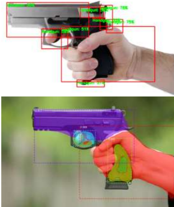
Fig. 4. Weapon detection in python

We detect the weapons hidden in the body or in the clothes depending on how their form shifts, are being worn. We are putting a lot of effort into finding hidden weapons and have already created a method to detect guns.