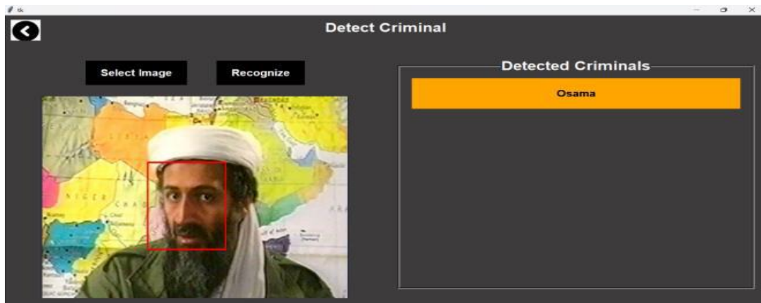
Fig1 Successful Registration of Criminal

Fig 1 and fig 2 shows the outcome of the project with detect criminal window and his profile consisting his basic information like his name, his father's name, gender, nationality, criminal and employment history etc. once the image is selected and opt for recognition the system compares the uploaded image with the images in the database. If the face is recognized when compared, the system returns the name associated with the image and corresponding information saved in database.