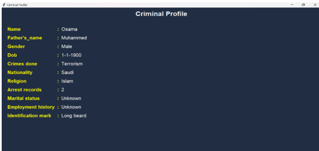
Fig 2 Criminal Profile