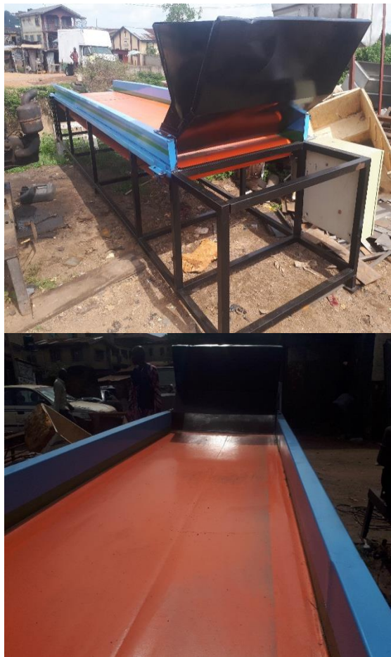
Fig 4: Pictorial View of the Fabricated Semi Automated Material Recovery Facility

Table 6 below shows the result obtained when the equipment was demonstrated. The result obtained indicates that the estimated carbon dioxide emission mitigated was 24,050.44kg/ ton of carbon dioxide