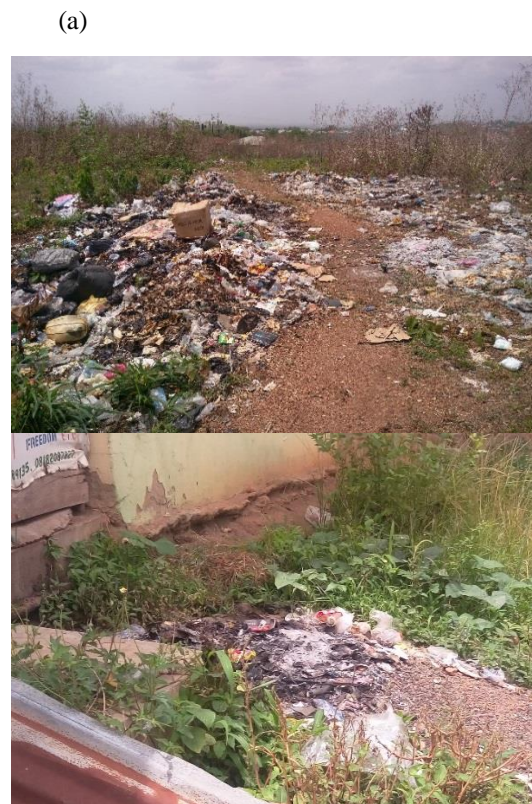
Fig 2: (a) Wastes deposited along the dump site route. (b) Illegal Burning point in the mini mart After the waste collection facilities were carefully inspected at the final disposal site, the types of waste identified from the study area are shown in table 1 below.