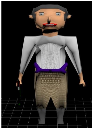
Fig 1. Character Development

Various levels of detail and animation can be provided to the characters. These can be coded later as well. Fig. 1 shows a sample character developed for the game.