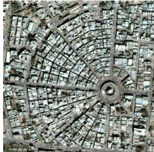
EXISTING LAYOUT GANJ GOLAI

as king of the country. The concept of Rashtrakuta, name of Royal family is used right from 4 th century A.D. Samrat Amoghwarsh titled himself as Lattlurpuradhiswar, as explained in inscriptions and copper plates.