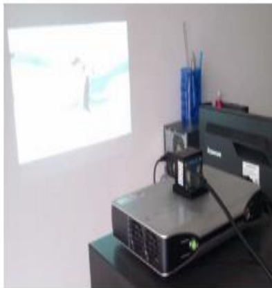
Fig. 1. System setup with the projector and the camera.

hand motion. Some Systems use retro-reflective spheres that can be tracked by infrared cameras. The “SociaDesk” project uses a combination of marker tracking and infrared hand tracking to enable the user interaction with software-based tools at a projection table. The “Perceptive Workbench” system uses an infrared light source mounted on the ceiling. A common approach these days is to use touch sensitive surfaces to detect where the user hands are touching the table, but it is argued that barehanded interfaces enjoy higher flexibility and more natural interaction than Camera Projector Projected Screen On a plane surface. Furthermore, tabletop touch interfaces requires special hardware that is still expensive and not readily accessible to everyone.