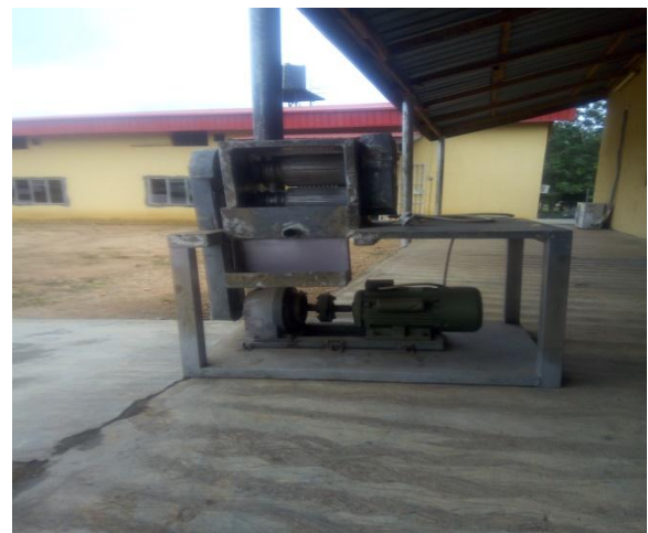
Plate 1: Sugarcane Juice Extracting Machine