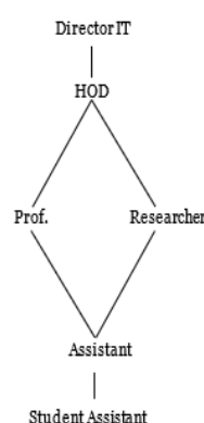
Figure 2.1:: Role Hierarchy

In an organization there are lots of people working in different departments. Each department has its own functionalities. Each person working in the department is associated with certain role(s). If we consider the organizational structure of Research lab as an example, we can see that there are lots