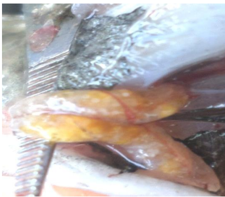
Figure 3: deformed eggs