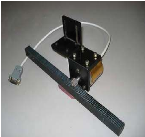
Fig.3-Rack and Pinion Gear

The rack is a type of linear drive that includes a pair of gears that convert rotary motion into linear motion. A circular gear is called an "the pinion" engages the teeth on a dashed "gear" linear called "rack"; The rotational motion applied to the gear causes the rack gear to move relative to the pinion, thus translating the rotational motion of the pinion into a linear movement.