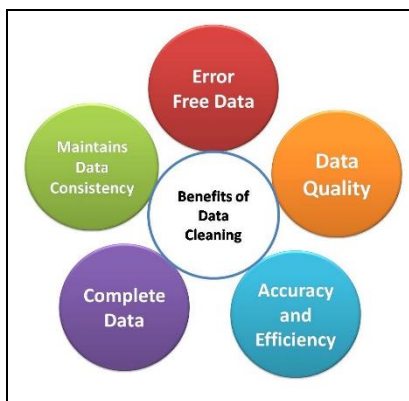
Fig. 1. Data Cleaning