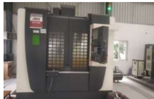
Fig. Error! No text of specified style in document. CNC vertical milling machine

The movement of the spindle in Y direction is front and back direction. The movement of the spindle in Z direction is up and down direction.