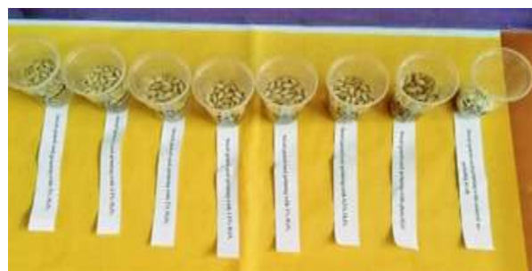
Plate 2. Priming process with H_2O_2

At first, only H_2O and those six solutions were taken in plastic glasses separately. The glasses were marked about the treatments and replications with a permanent glass marker. Then the 200 seeds for each replication were taken in plastic glasses to soak in the desired solutions for six hours in the Laboratory of Horticulture (Plate 2).