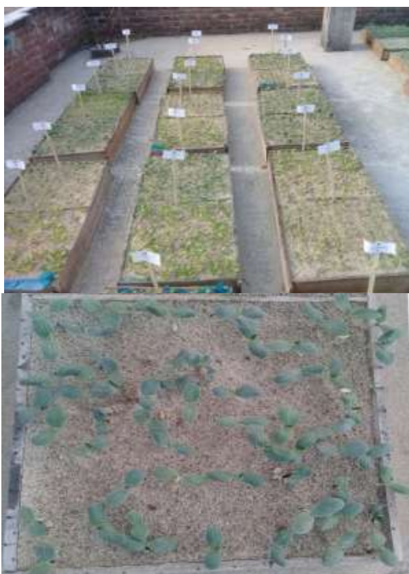
Plate 3. Growing the seedlings in the seed flats

The unprimed and the primed seeds were then dibbling immediately in the seed flats (Plate 3) at the depth of 2cm in lines on the 10 th March, 2019 at the distance of 5cm between rows and seeds too. After sowing, the seeds were covered with hyaline polyethylene sheet and concrete poles (at one foot high) to protect the seeds and seedlings from heavy rainfall. Light watering with a watering cane was done as needed. Hand weeding was also done as per need.