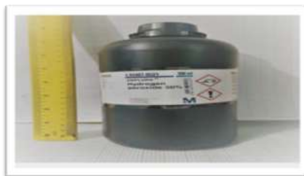
Plate 1. The container of the H_2O_2 (30%) used in the study

The required solutions were prepared by diluting the required amounts of the H_2O_2 (30% strength, Plate 1) with H_2O to get these six concentrations: 0.5, 1.0, 1.5, 2.0, 2.5 and 3.0%.