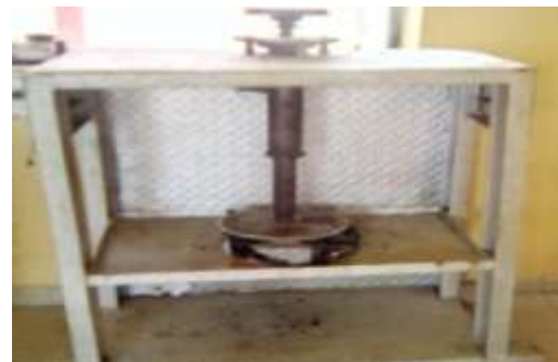
Figure 3: screw press used in briquettes compaction.

Trials on the compaction on the slurry samples were carried out using a screw press machine. A metallic rectangular die of dimension 12.3cm x 9.2cm x 7.3cm length, width and height respectively, were used for this study. The die was freely filled with known weight for each sample mixture and positioned in the screw powered press machine for compression into briquettes. The screw iron rod was actuated through manual rotation of the Disc couple on the iron rod which move in other to compress the sample produce. A known pressure was applied at a time to the material in the disc and was allowed to stay for 4 minutes (dwell time) before ejection and the briquette formed was then being aired/sun dried. Stop watch was used for timing purpose. Figures 3 and 4 below shows sample of briquettes production using the screw press machine while figures 5 and 6 shows smoking process using briquettes and firewood