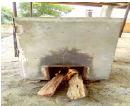
Figure 6: Smoking process using firewood

The initial weight of the sample was determined ( W_1 ) before drying in the sun. During the drying process, the reduction in moisture content was recorded every 4 hours for 48 hours. The samples were removed from the sun and reweighed ( W_2 ). The moisture content of the sample was calculated using the following expression,