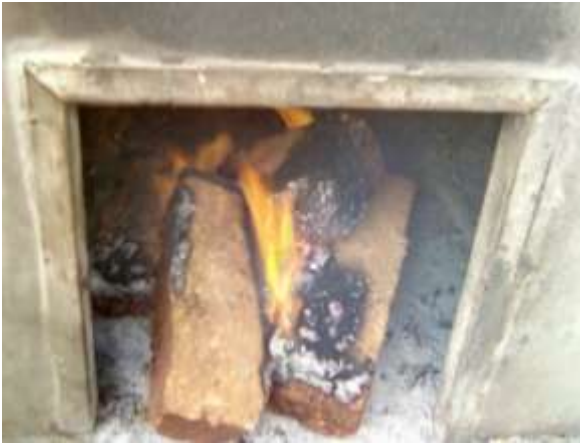
Figure 5: Smoking process using briquette