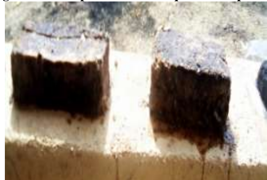
Figure 4: Samples of briquettes