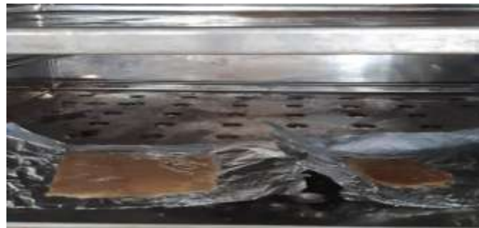
Figure -3 Drying the film in hot air oven