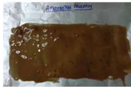
Figure-1 Heat of the mixture Figure -2 Spread over the Sheet