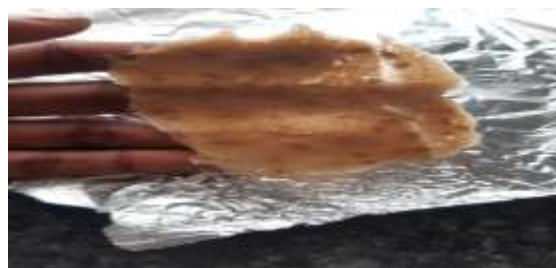
Figure -4 Bioplastic film