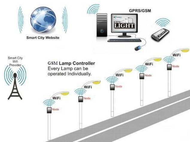
Fig 1. Street light controller with wireless technology

Thus message is decide whether the street light should ON/OFF by the help of gsm and microcontroller circuit It enables regulate their communication strategies according to dynamically changing network environment. Street lights should work on the systematic manner by the help of circuit and huge reduction in power consumption on whole around the world it is -less costly and effective in manner .it should reduce the time wastage of human effort and control from one place or any common panel. Provide the better efficiency to do work.